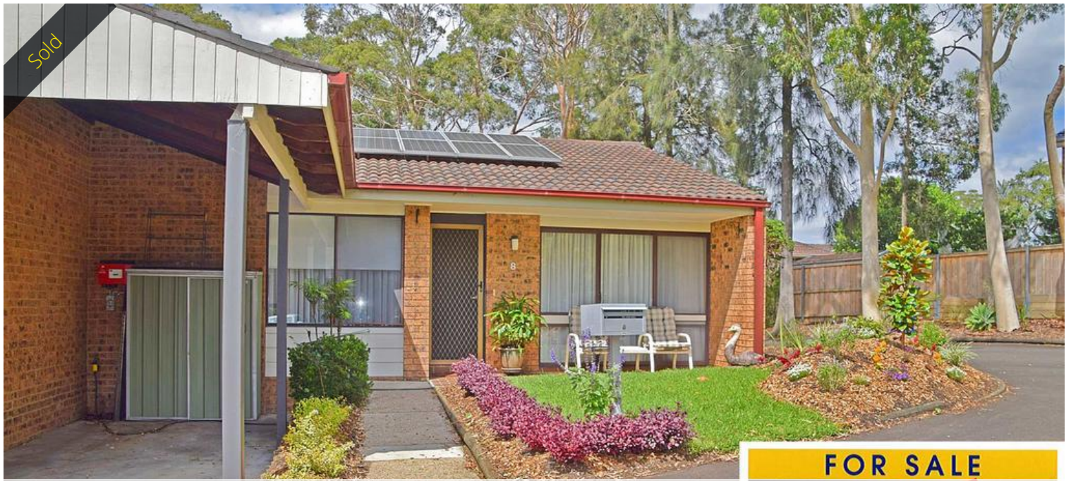
Villa 8, 2 Kitchener Road, Cherrybrook